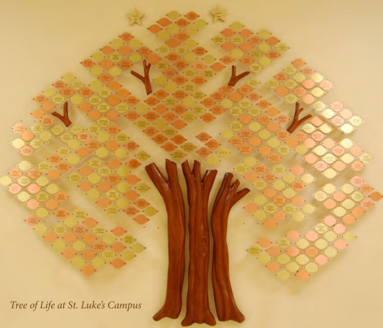
Tree of Life at St. Luke's Campus